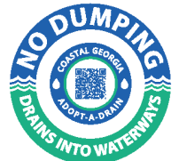
Storm Drain Marking Tile

The Chatham County Department of Engineering received a Coastal Incentive Grant (CIG) from the Georgia Department of Natural Resources (GA DNR) to develop the Coastal Georgia AAD Stormwater Volunteer Program. This program will work with local residents to label and monitor Unincorporated Chatham County storm drains, specifically the drains along the road known as “curb inlets.” Customized storm drain marking tiles display a QR Code which links to the County’s Stormwater webpage ( http://engineering.chathamcounty.org/Stormwater/About ).