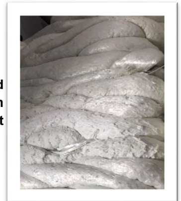
Recycled Styrofoam Ingot